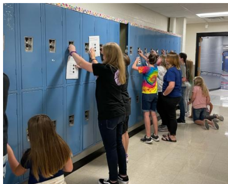
5th grade students practicing locker procedures on the second day of school

Over the next few weeks, students will begin taking beginning of the year assessments. These include Exact Path and PALS. Some students may feel anxious about things they don't know. Assure your child that it's ok and to just do their best!